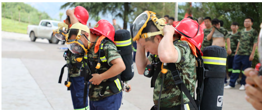
Emergency response skills competition in Henan Found

In Fiscal 2023, Henan Found organized an Emergency Response Skills Competition, during which the company invited instructors from Luoyang Emergency Rescue Center to provide conducting two days of intensive training for its emergency rescue team of employee volunteers and organized an emergency rescue competition in its No.1 Pressing Plant.