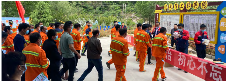
Pop-quiz on occupational disease prevention

From April 25 to May 1, 2022, both Henan Found and Guangdong Found organized the "Everything for the Health of Workers" themed event across their frontline units to raise employees' awareness of occupational disease prevention. A wide variety of activities were organized to create a robust culture of occupational disease prevention and highlight the responsibility for occupational disease prevention, including hanging banners and posters in working areas, distribution of information brochures, organizing trainings for workers, hosting pop-quiz, etc.