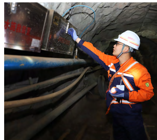
Check the water supply facilities

In Fiscal 2023, we revised and optimized the Double Prevention System for Classification Control of Safety Risks and Investigation and Rectification of Safety Hazards , including new requirements for safety risk public reminders, such as posting safety risk bulletin boards in workshops, and the requirement for more extensive risk education and skills training to ensure that all management staff and employees shall have the basic understanding of safety risks and how to prevent them from happening and how to cope with them in emergencies.