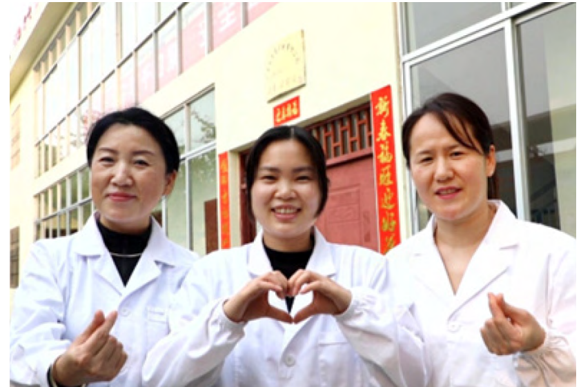
Caring for employee health